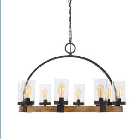
ATWOOD, 8 LT PENDANT