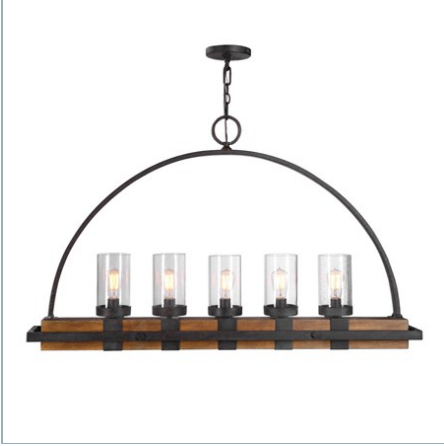
ATWOOD, 5 LT ISLAND