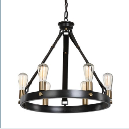
MARLOW, 6 LT CHANDELIER