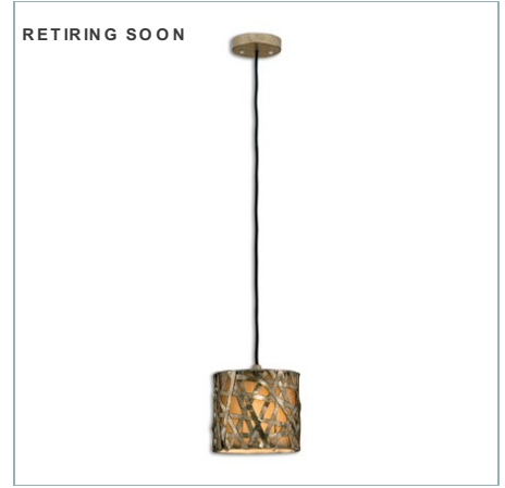
ALITA CHAMPAGNE, 1 LT MINI PENDANT