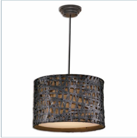
ALITA, 3 LT PENDANT