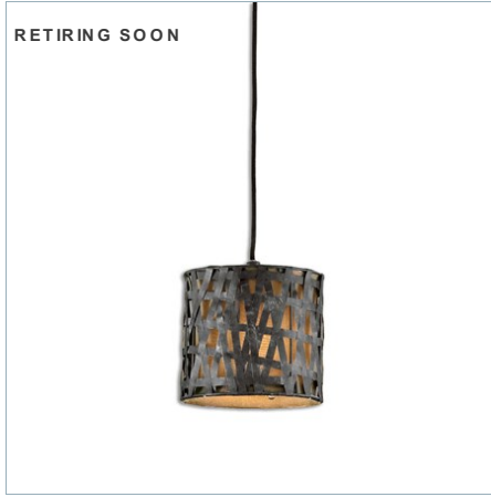
ALITA, 1 LT MINI PENDANT