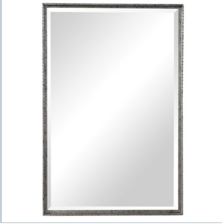
CALLAN VANITY MIRROR, SILVER