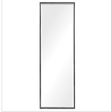
CALLAN MIRROR, BLACK