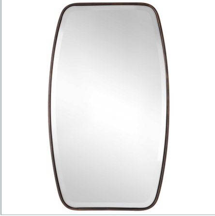
CANILLO MIRROR, BRONZE