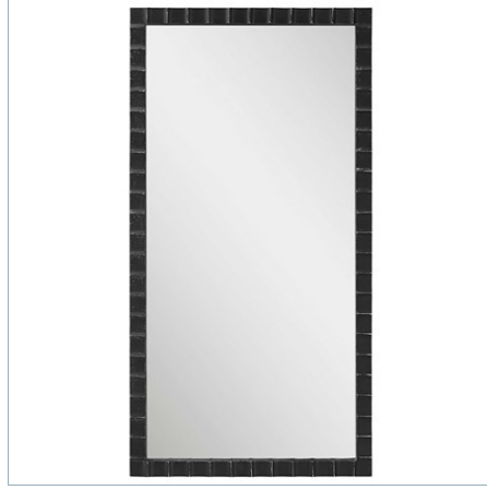
DANDRIDGE MIRROR, BLACK