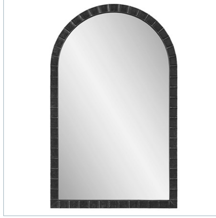
DANDRIDGE ARCH MIRROR, BLACK