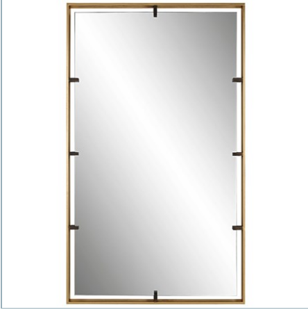
EGON MIRROR, GOLD