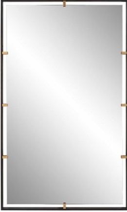
EGON MIRROR, BRONZE