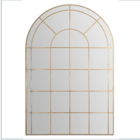
GRANTOLA ARCH MIRROR, GOLD