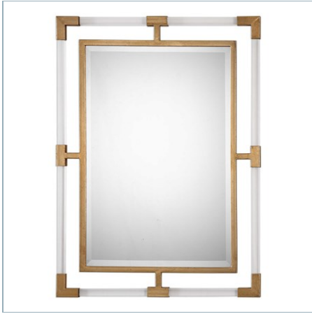
BALKAN MIRROR, GOLD