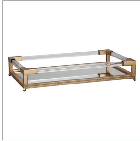
BALKAN TRAY, GOLD