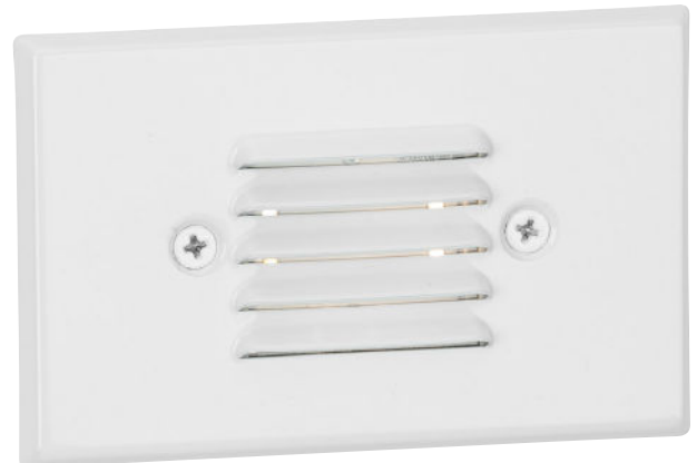
Shown in horizontal installation